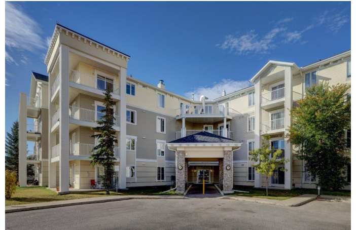
1413-1140 Taradale Dr NE, Calgary, AB