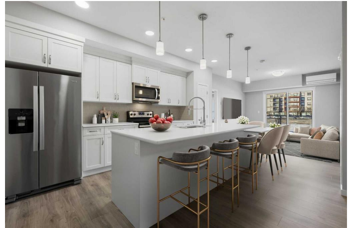
#214, 20 SETON PARK SE REC-A MEASUREMENT STANDARD - CALGARY AB MAIN LEVEL (AG) - 822.28 Sq Ft. / 76.39 m² TOTAL ABOVE GRADE RMS SIZE - 822.28 Sq Ft. / 76.39 m²

Modern 2-Bed, 2-Bath Condo in Vibrant Seton “Urban Living at Its Finest! Welcome to Park Place in Seton, where lifestyle and location come together in perfect harmony. This immaculate and stylish 2-bedroom, 2-bathroom condo offers a private, quiet setting just steps from Seton’s award-winning urban district, packed with amenities including restaurants, shopping, fitness, and the Cineplex VIP movie theatre. Designed with both comfort and functionality in mind, the open-concept layout creates an inviting space ideal for entertaining or everyday living. The showpiece kitchen boasts upgraded white shaker cabinetry, sleek quartz countertops, a central island with breakfast bar seating, and premium stainless steel appliances—perfect for home chefs and hosting guests. The spacious living area is filled with natural light and enhanced by luxury vinyl plank flooring, adding warmth and durability. Smartly designed with bedrooms on opposite sides of the unit, both offer privacy and convenience—each featuring ample closet space, organizers, and their own bathrooms. The 9-foot ceilings add to the airy feel, while the titled indoor parking stall offers year-round convenience and security. Seton is more than a neighbourhood—it’s a lifestyle. Live healthy and connected in a thriving, walkable community where you’re minutes from the South Health Campus, the world’s largest YMCA, green spaces, transit, and the upcoming LRT extension.