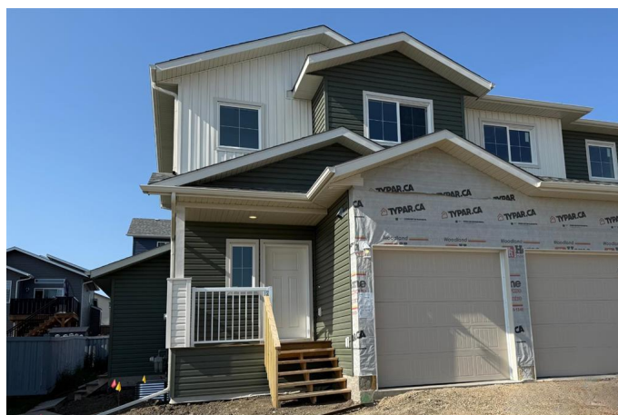
The Oxford II Duplex Unit with basement suite 1,337 s.f./ 1,316 s.f.