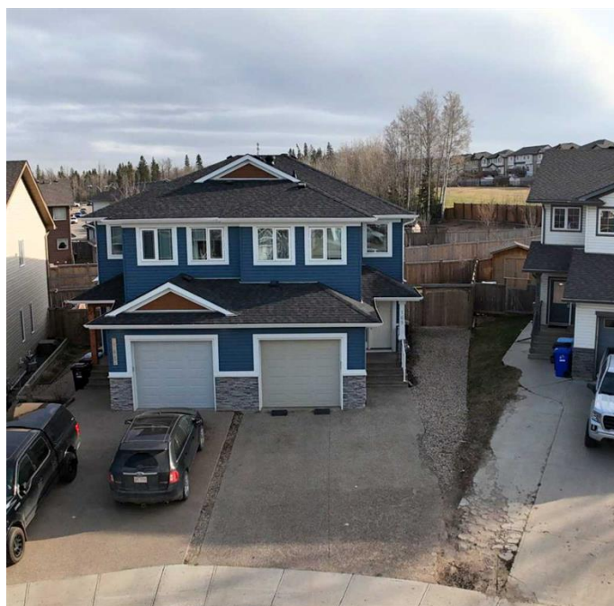
169 Shalestone Way, Fort McMurray, AB

Upstairs, youâ€™ll find TWO primary bedrooms, each with its own ensuite! The main bathroom is a 4-piece ensuite for the second bedroom. Amazing dual function and perfect for guests or a growing family. There is a third bedroom upstairs, also great for