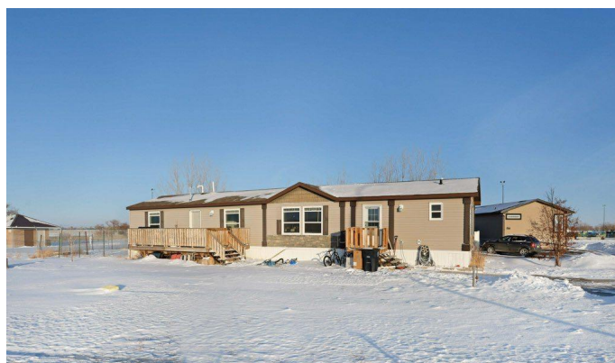
127 Meadowplace Dr E, Brooks, AB

Main Floor Exterior Area 1517.55 sq ft Interior Area 1391.31 sq ft