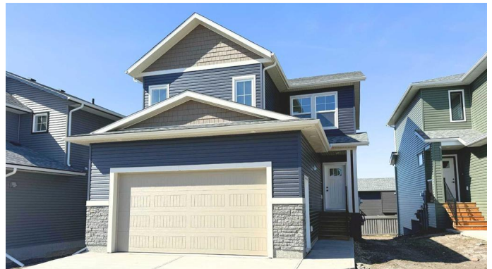
The REDMOND II 2,000 sq. ft.